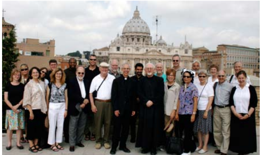
A delegation of faculty and administrators from the College of the Holy Cross met with Rev. Peter Hans-Kolvenbach, SJ, Superior General of the Society of Jesus, in June 2007.

Five years ago, given the opportunity by the Thomas and Dorothy Leavey Foundation, Holy Cross decided to see if we could make a major leap in terms of faculty formation to Jesuit identity. We developed a 10-day faculty Ignatian pilgrimage to Spain and Rome, inviting faculty from three other Jesuit schools to join us. It was so successful that we found a way to continue it through Lilly Endowment Vocation funding. 2008 marks our fifth pilgrimage. To date, more than 40 faculty and administrators from Holy Cross, and as many from other Jesuit colleges and universities, have participated.